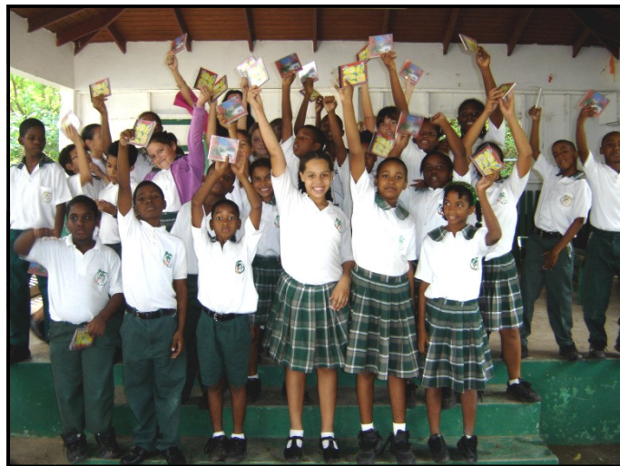
Contest-winning Sr. Magda students receiving their copy of the CD

All proceeds go to conservation on St. Maarten.