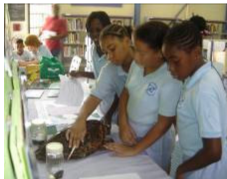
Looking at a hatchling

A heartfelt word of thanks to the Philipsburg Jubilee Library for offering to showcase the children's creative works and helping us to bring awareness about Sea turtles!