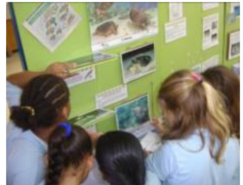
Learning about different turtle species

In October all primary schools were invited to visit Nature Foundation's 2-week Sea Turtle exhibition at the Philipsburg Jubilee Library.