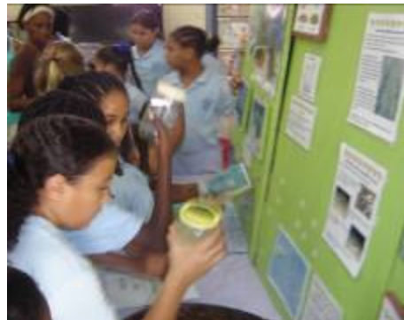
Looking at unhatched turtle eggs in a jar