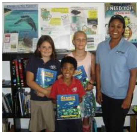
The three happy prize winners