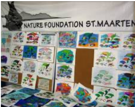
A wall of bright colours