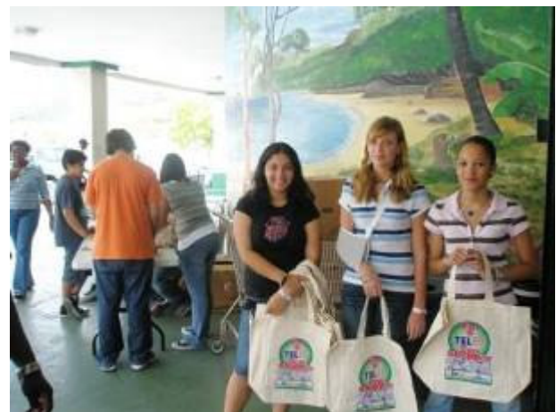
LU student volunteers

The next challenge will be eliminating the use of Styrofoam containers in fast food restaurants and snack bars.