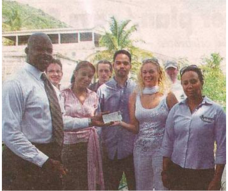
Presentation of cheque to Nature and PRIDE Foundation by government officials. Also present were representatives of contracting and consulting engineering companies (photo courtesy A. Singh—The Daily Herald).

Pond and Little Bay Pond after Hurricane Louis in 1995.