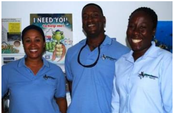
NFS staff in new work uniforms (photo courtesy A. Singh—The Daily Herald).

The two-toned blue uniform includes cap, light blue polo and dress shirt with navy short and long trousers and skirt. Our logo is visible on the cap and shirts. Some shirts read 'Manager' on the front while others read Marine Park Authority" on the rear.